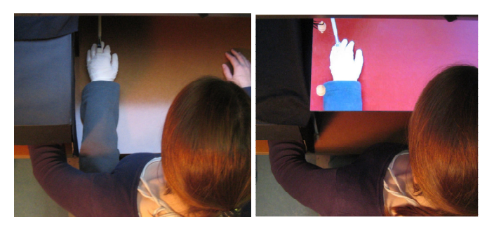
Figure 2. Rubber hand illusion test. (Left) Real rubber hand illusion, showing rubber arm being stroked with a paintbrush. (Right) Virtual rubber arm illusion, showing video of rubber arm being viewed in mirror.