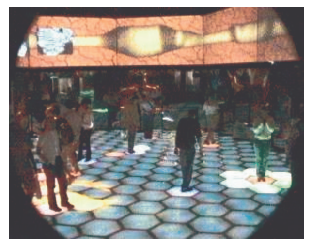
Figure 2: A typical live user interaction scene within Ada. Visible are floor tiles, a light finger highlighting a visitor (centre left), a dynamic 3D visualisation (top) and a live gazer video on the screens (top left).

station, May 2001, 100,000 visitors), where a system called Gulliver was run for three days in collaboration with the Remote Sensing Laboratories in the Department of Geography of the University of Zurich. Gulliver contained light fingers that could follow visitors, and a floor used as a large collective joystick to control a simulated flight over Switzerland. Zürifäscht, the triennial Zurich city festival in July 2001, provided the setting for the next system test. This time a more Ada-like system called Gulliver II was deployed over three days, including a raised area from where spectators could observe the space, and some displays showing the internal operations of Gulliver. Some basic Ada functionalities were tested, such as visitor tracking with floor tiles and light fingers, displaying visitor trajectories on the floor, sound localisation of handclap noises and a group football game. The two key issues that stood out from the results of the tests were the need for effective visitor flow control, and the importance of communicating Ada's intentions clearly through the use of effective cues and visitor pre-conditioning sequences.